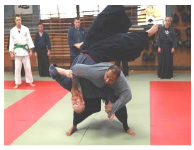
Koryu- Old Style 古流

If a given student does not take responsibility for their part in this process, the pressure so frequently leads to pain avoidance. This may lead to missing classes, which artificially takes the pressure off. In that case, the opportunity to grow by forging on through adversity with honest intent is lost. This is running away from the crucible . This is what we do not want. It is a loss that is felt more deeply than that person can expect. Unfortunately, this process of falling away can even happen with people with advanced levels of training. The longer the time away, the harder it seems to come back.